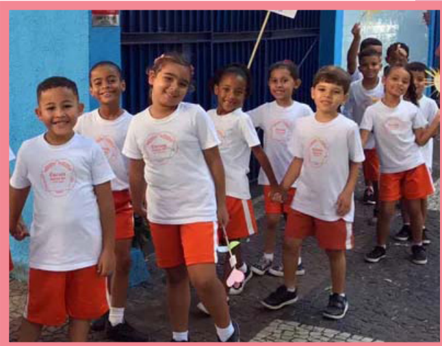
On 23 April 2023, children from the Sathya Sai School of Vila Isabel in Rio de Janeiro, Brazil, uplifted the onlookers during a rousing Walk for Values in their neighborhood!