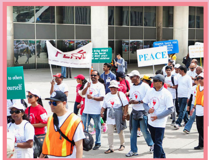
On 24 April 2024, like every year, students at the Sathya Sai School of Toronto, Canada, walked for Values. Prior to the event they did a self-assessment to determine the value they needed to practice for personal growth and made a pledge to do so during the year.

You can find out more at: https://walkforvalues.com