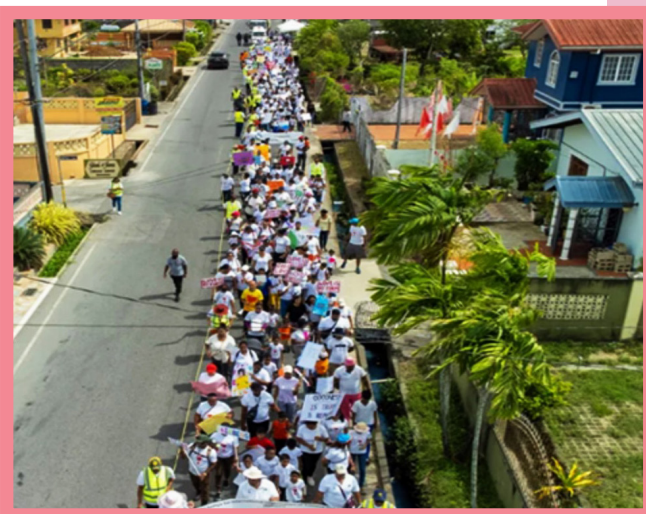
On May 6, 2023, five Sathya Sai Schools in Trinidad and Tobago organized their first Walk for Values and Environmental Fair. The theme of the event in which over 350 people took part was "Building Communities of Character, One Step at a Time".