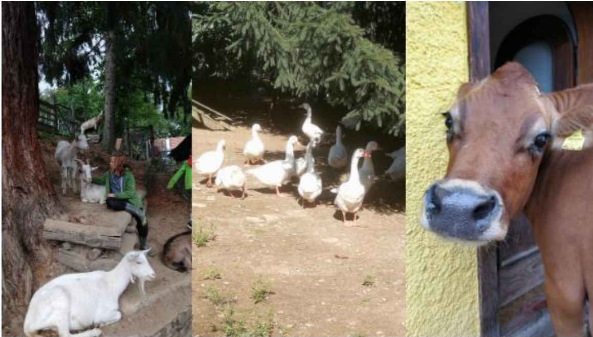
Tic, Tac, Toe & Rainbow (In Front) (Goats)