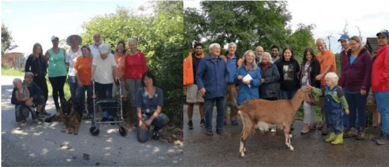
The Sai Animal welfare Team supporting Animal Spirit, Austria