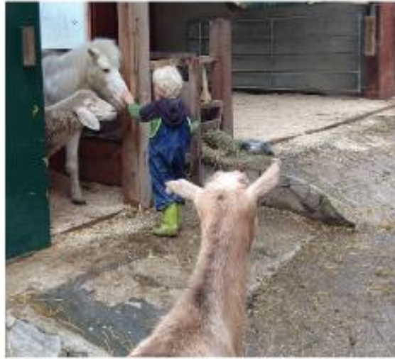
Alba (Pony), Sunshine (Sheep)

Children recognise the intrinsic value of animals; they know they are so important simply because they are living creatures. They ignite in the children a lifelong love of animals, and encounters with wild animals can be extra-special. Children learn about their differences and similarities and their needs (such as for food, shelter, space) and in this way their compassion and empathy for the animals grow.